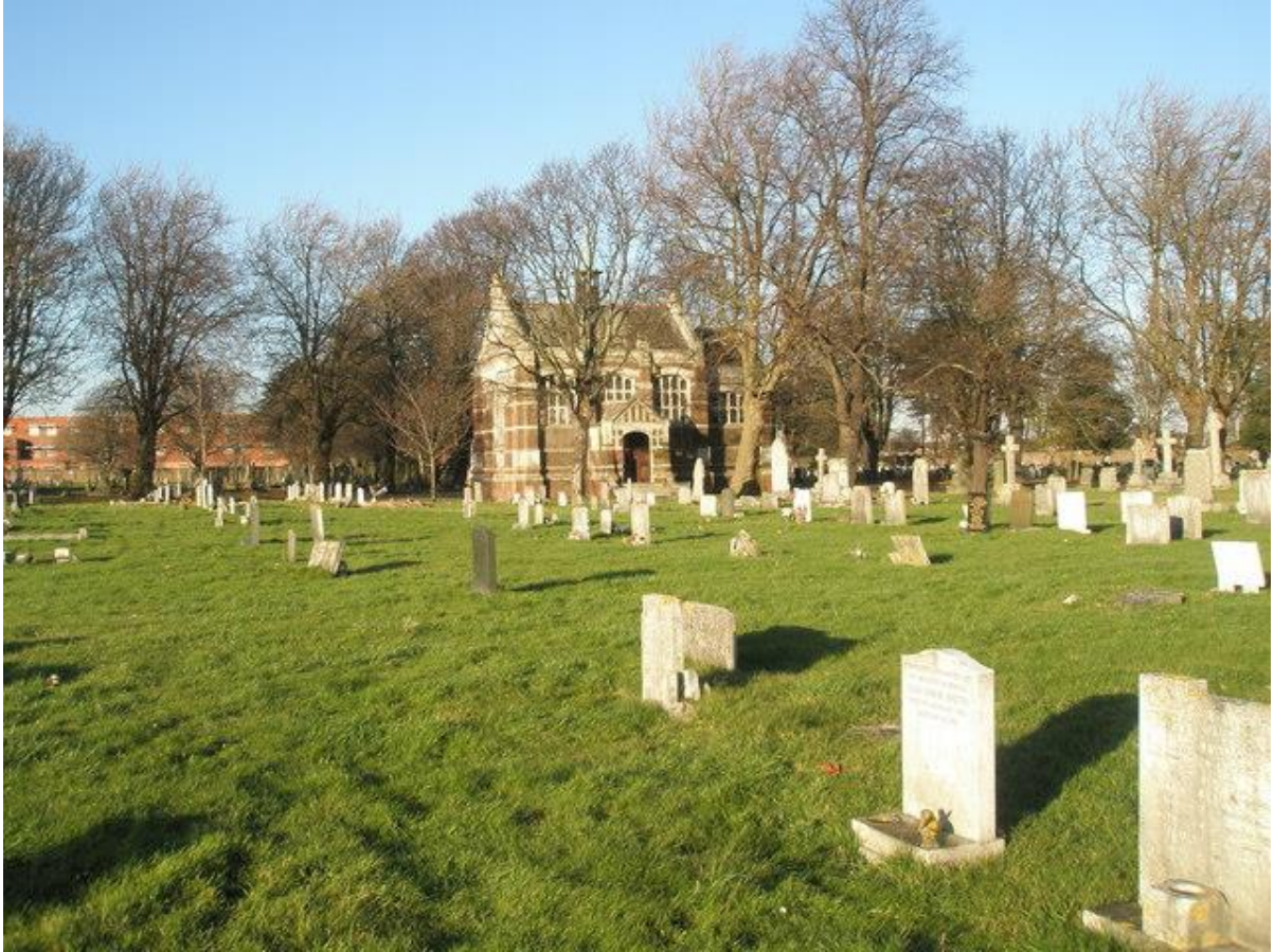
Cemetery Chapel at Milton Cemetery, Portsmouth