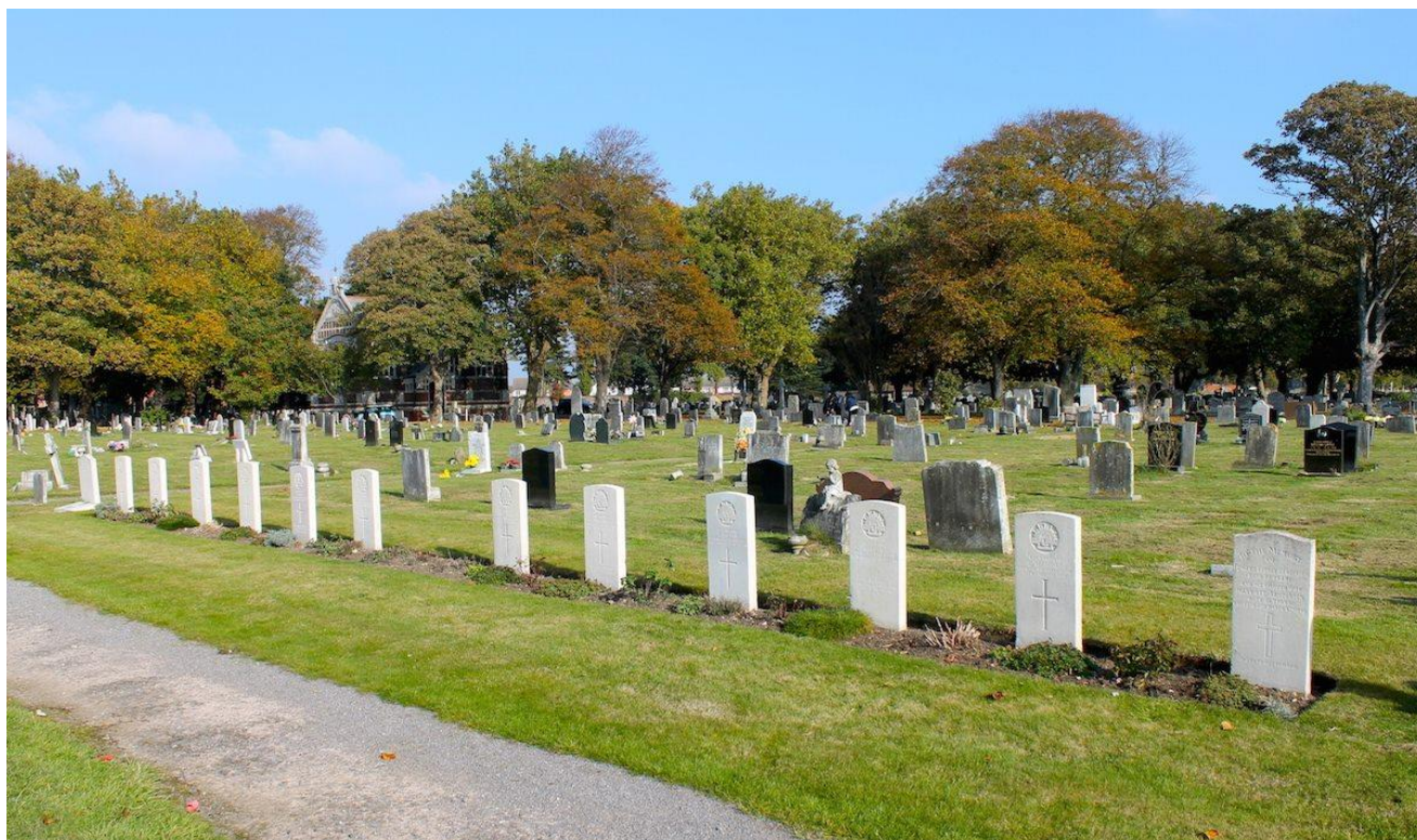
Australian War Graves in Milton Cemetery, Portsmouth